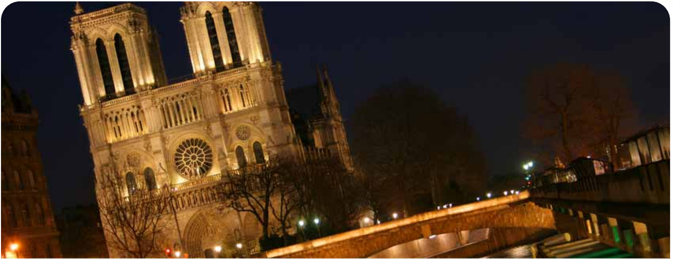
Notre Dame Cathedral