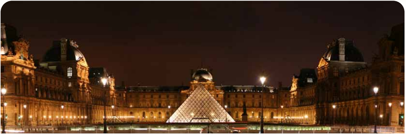
The Louvre Museum