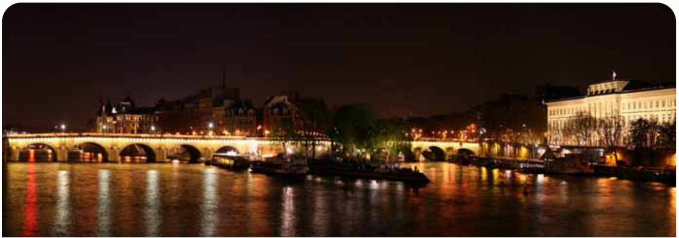
The Pont Neuf and the tip of Ile de la Cité