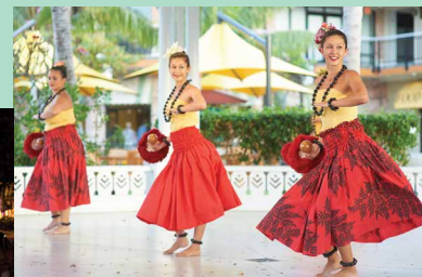
*See calendar of events for more information